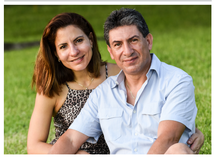
Sign-up to receive emails on future Savvy Caregiver Trainings: