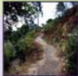
Uphill side of trails

Ticks are found in natural areas that have grasses, shrubs, or leaf litter under trees.