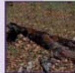
On logs and fallen branches