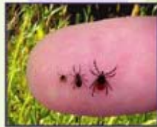
TICKS ARE SMALL!

Ticks are small, spider-like creatures that feed by attaching to animals and sucking blood.