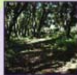
Mixed hardwood forests