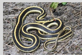
Common Garter snake