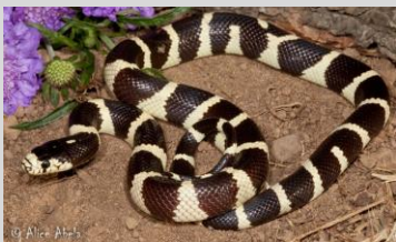
California King snake