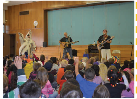
The Banana Slug String Band performs "We All Live Upstream" at a local school

Educating the next generation about pollution prevention is critical to the success of future efforts. Keep up the good work Farallone View Elementary!