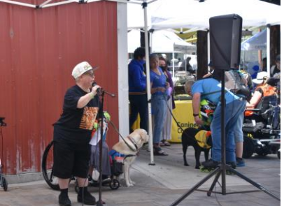
August 11 th, 2022