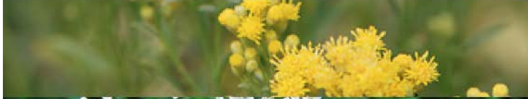
Euthamia occidentalis western goldenrod