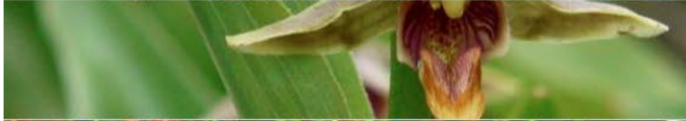
Epipactis gigantea Giant Stream Orchid