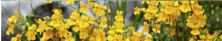
Mimulus guttatus Seep Monkeyflower