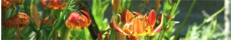
Lilium pardalinum, Leopard Lily