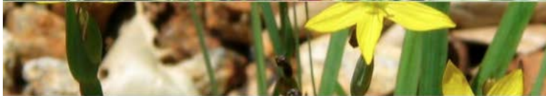
Sisyrinchium californica, Yellow eyed grass