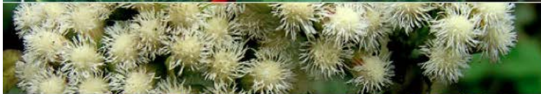
Baccharis douglasii Marsh baccharis