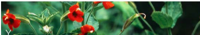
Mimulus cardinalis Scarlet monkeyflower