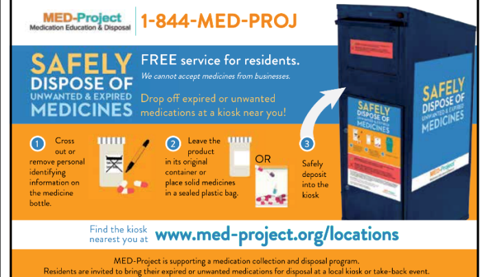
Figure 16: Example - Catholic San Francisco