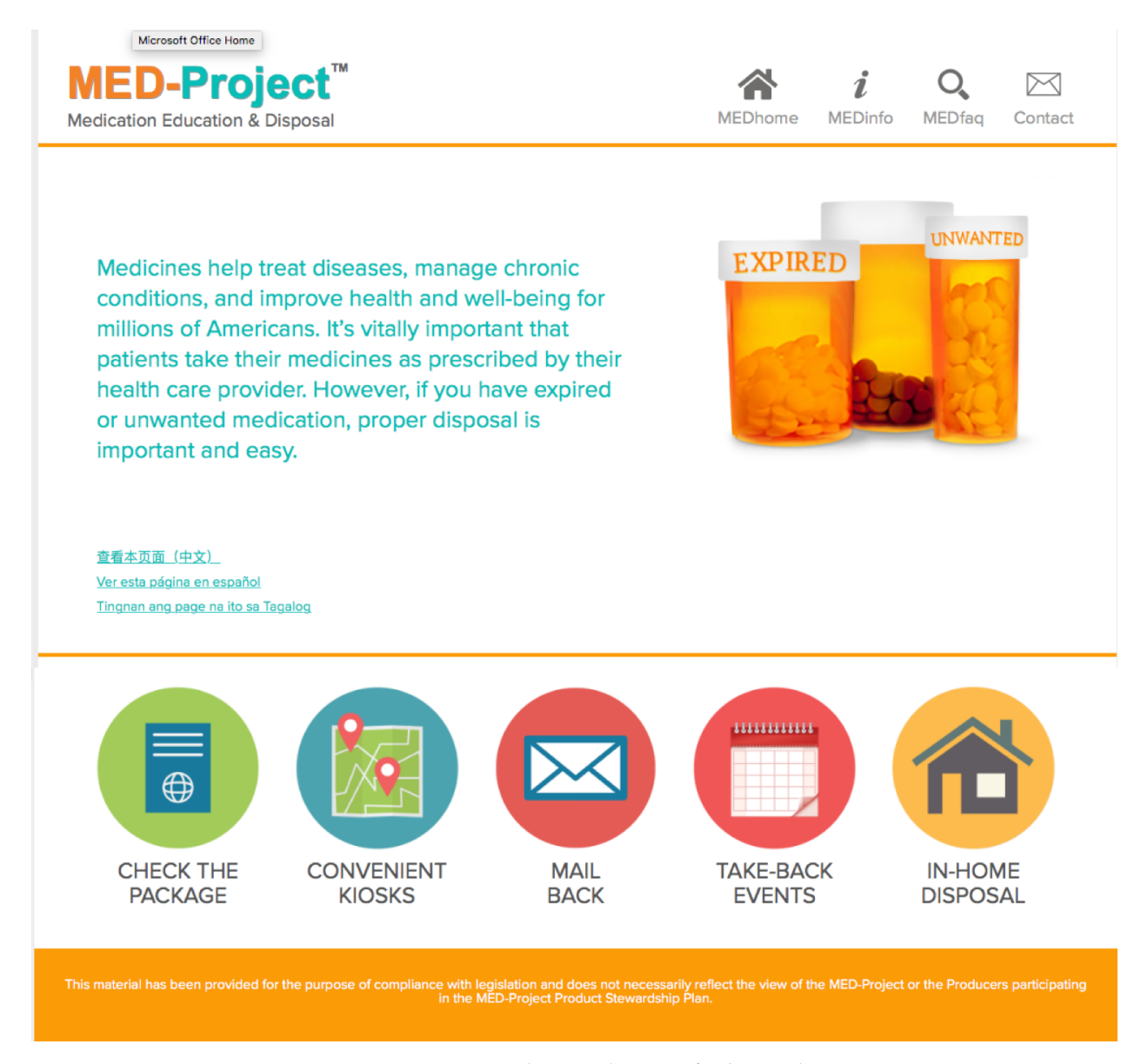
Figure 1: MED-Project Website Landing Page for the Jurisdiction

Brochures, frequently asked questions (FAQs), and public service announcements in video and audio form can be viewed and downloaded from the website.