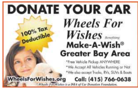
14 SAN FRANCISCO EXAMINER · SFEXAMINER.COM · SUNDAY, AUGUST 27, 2017