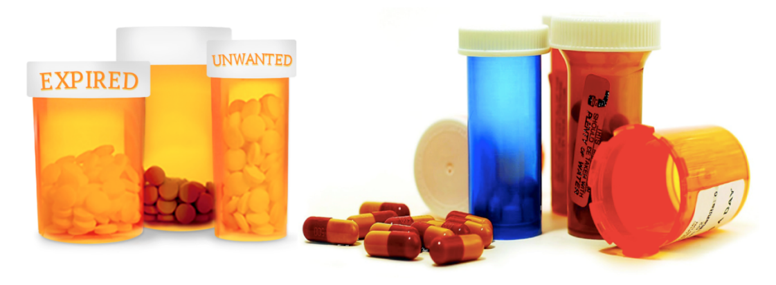
Figure 14: Example - Take-Back Event Flyer