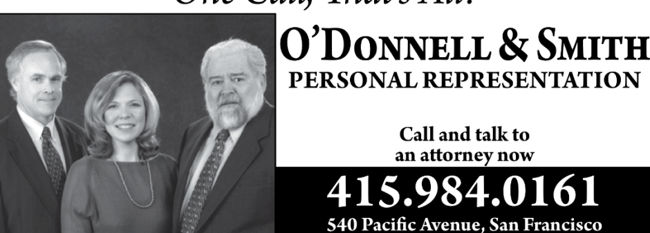
Figure 15: Example - Archdiocese of San Francisco Directory