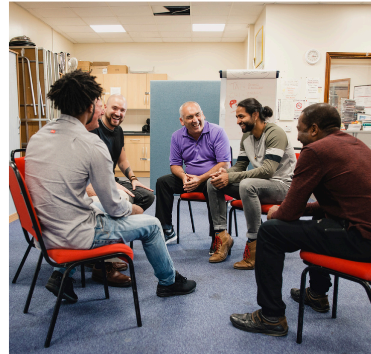
Suicide Loss Team