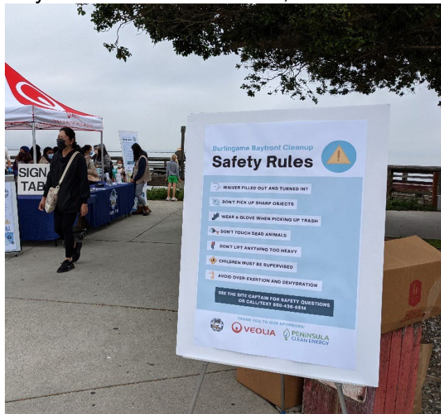
City of Burlingame's Safety Poster