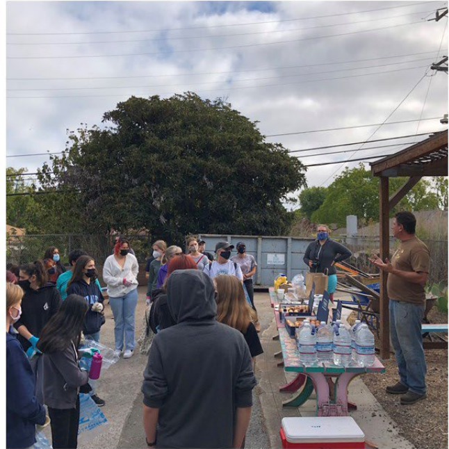
Coastal Cleanup Event Setup Examples – The Club at Westpoint, Redwood City High School