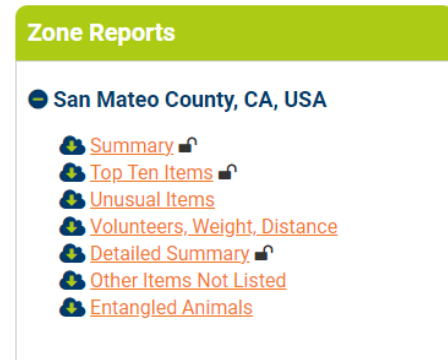
Pullable Report Examples