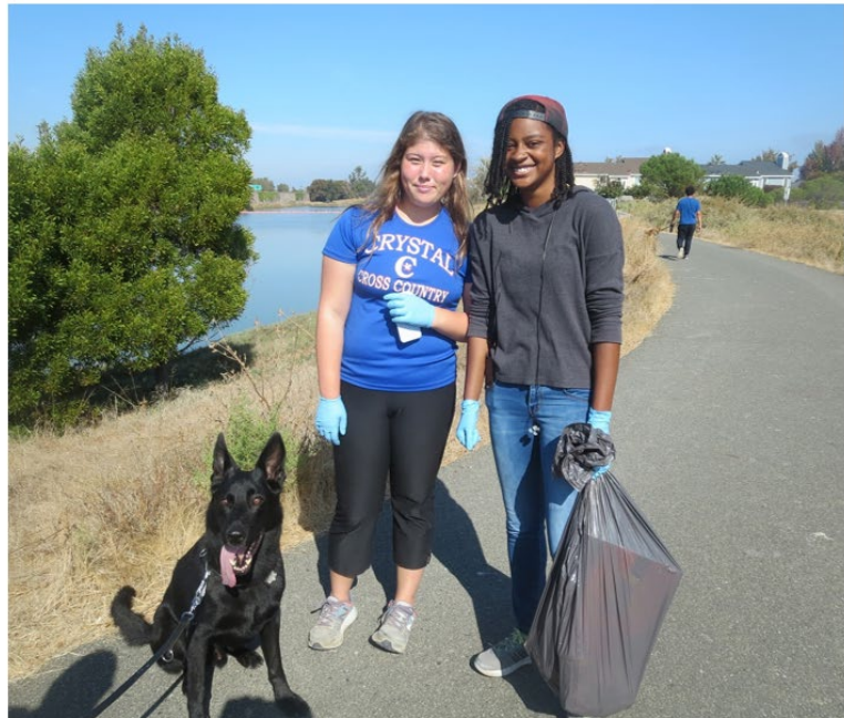
Coastal Cleanup Volunteers, various locations