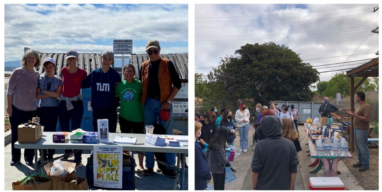
Coastal Cleanup Event Setup Examples - The Club at Westpoint, Redwood City High School