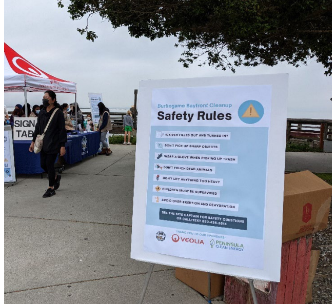
City of Burlingame's Safety Poster