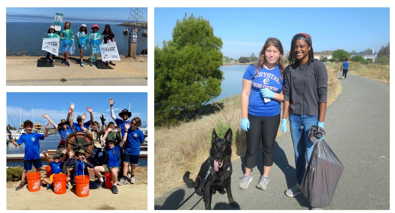
Coastal Cleanup Volunteers, various locations