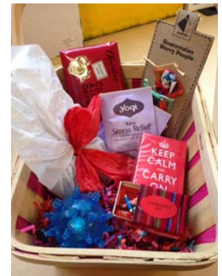
Healing Basket for Healing Heroes.

SAMHSA’s Concept of Trauma and Guidance for a Trauma-Informed Approach: