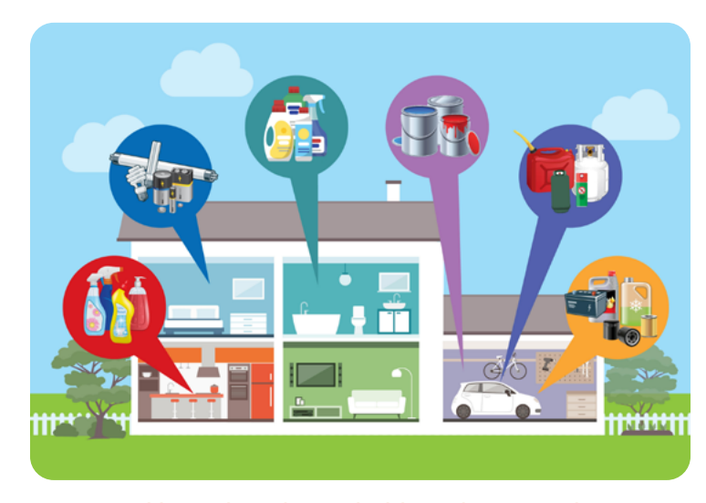
Hazardous household products can be found all throughout the home!

Your child will make a list of hazardous products from at least three different rooms or areas of your home. Your child will identify