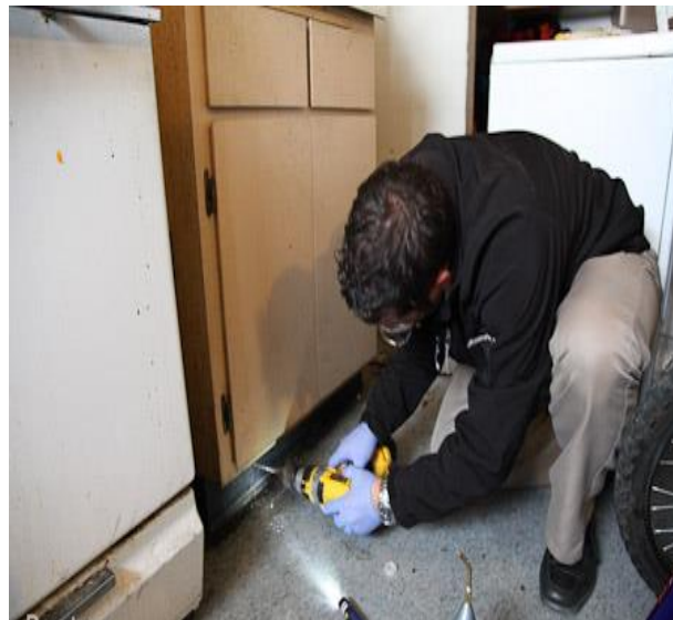
Structural Repairs can prevent pest harborage and access