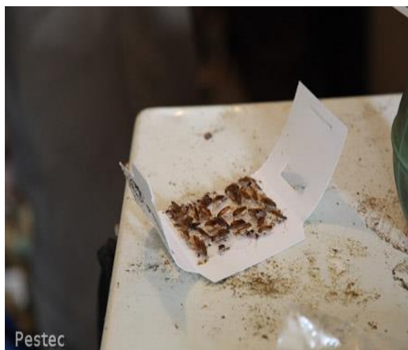
Cockroaches are the most common pest encountered in multi-family housing communities

Cockroaches and mice are the most frequently encountered pests in SFHA multi-family communities. Both pests pose potential threats to human health and cause structural damage to residences. The presence of either cockroaches or mice significantly decreases the air quality of a building and both are known allergens and asthma triggers. Both species are also known vectors for human disease.