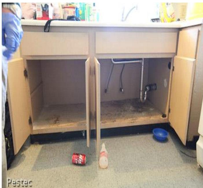
Kitchen sinks provide pests food, water, shelter and access into and through buildings