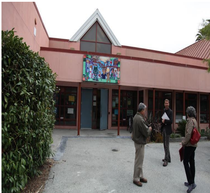
The IPM Team is essential to an effective IPM Program

Successful IPM programs define the roles and responsibilities of pest management stakeholders through the development of an “IPM Team”. Stakeholders include administrators, property managers, maintenance staff, resident support staff, building occupants and pest management professionals (PMPs). Defining the roles and responsibilities of each of these stakeholders provides an outline for how IPM should be implemented within an organization and how communication about pest management needs is organized and addressed. IPM Team members are responsible for making decisions about pest management and carrying out the various pest management operations of the IPM program. The basic roles of the IPM team are outlined below.