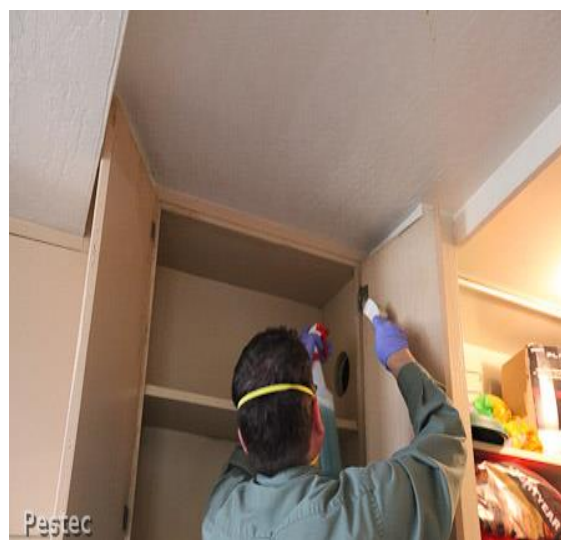
Sanitation is pest prevention and control