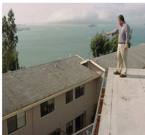
Inspections are the primary weapon in an IPM Program

Inspections are the primary weapon in an IPM program and provide a wealth of information about pests and the environments where they live. The goal of an inspection is to detail pest activity present and building conditions that cause pest activity, such as sources of food and water, areas of harborage and points of access into and through buildings. Inspection reports detail “pest prone places” that require regular monitoring and map the placement of all monitoring devices left behind. Reports should include an evaluation of the severity of any infestations or deficiencies found (e.g. “severe”, “moderate”, “minimal”) and a list of recommended actions necessary to treat infestations or abate structural and sanitary deficiencies. Sample inspection forms and reports in Appendix I can be adapted to meet the needs of pest inspections at SFHA communities.