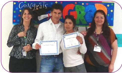
Parent Project ® Graduates

"This class has been most useful to me because I just migrated here from Tonga. It gave me an opportunity to learn about raising children in this country."