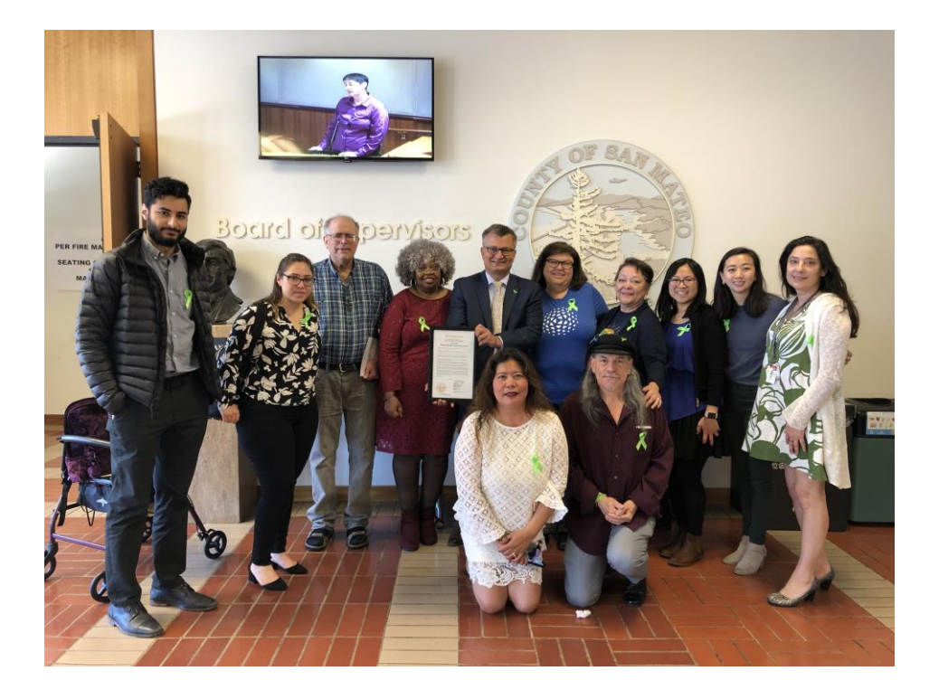
2019 Board of Supervisor Proclamation for Mental Health Month

Virtual Location: Via Zoom (link posted Friday before at <u>https://sanmateocounty.legistar.com/Calendar.aspx</u>)