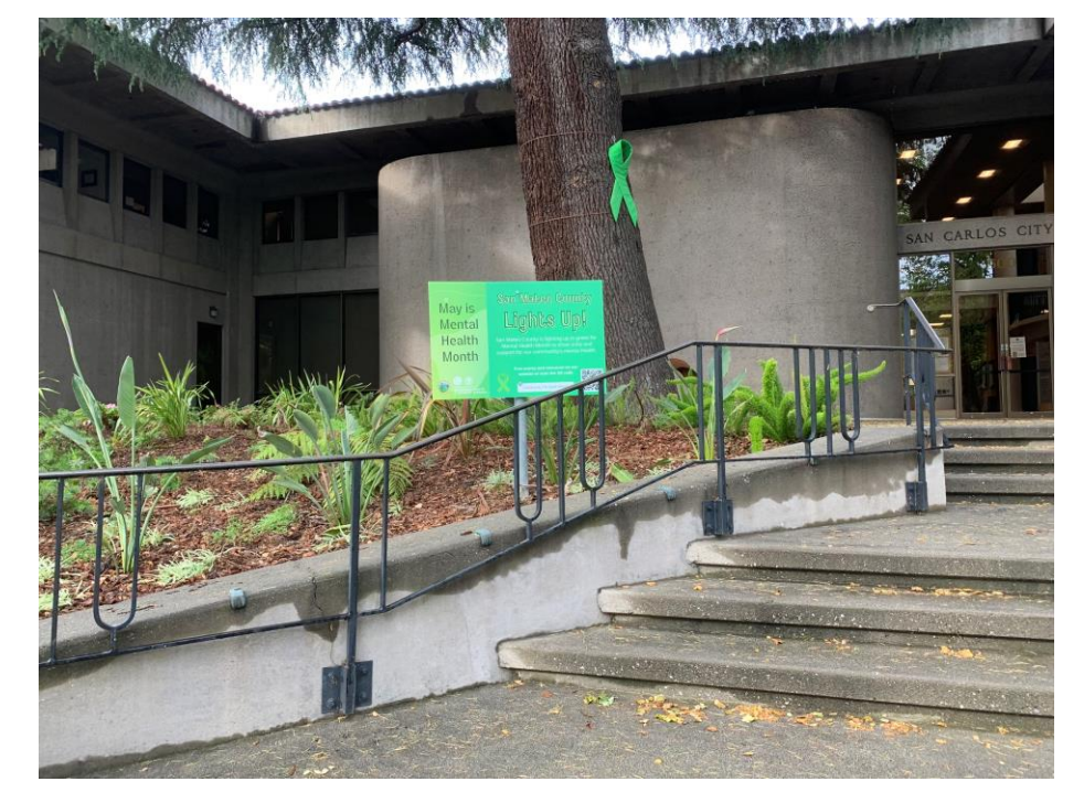
San Carlos City Hall