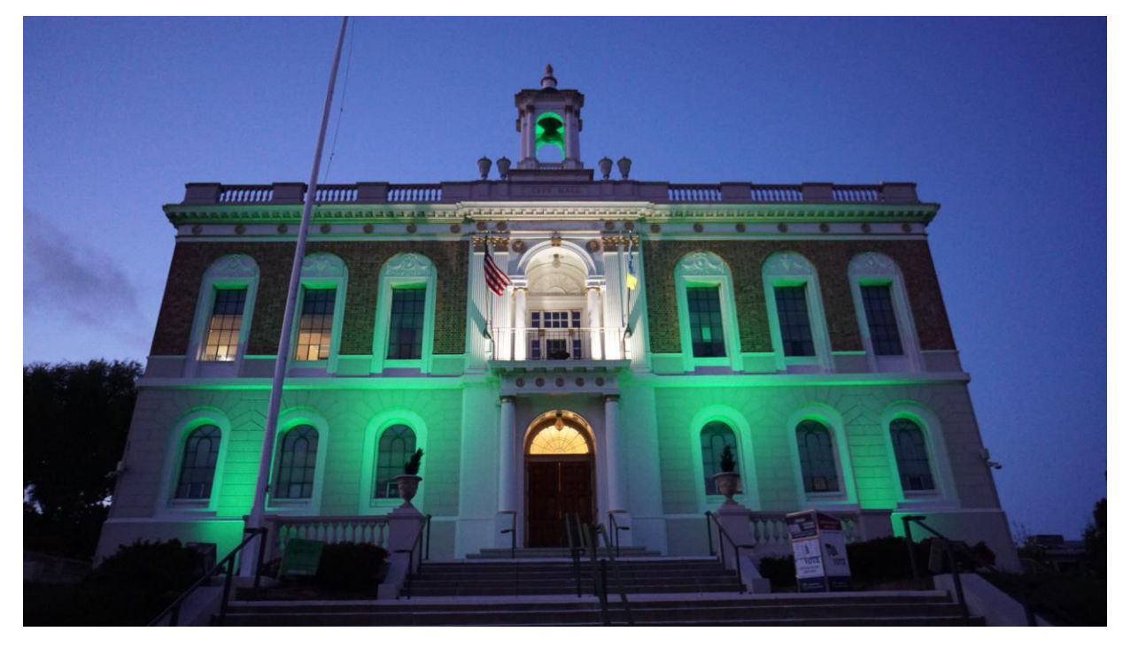
South San Francisco City Hall